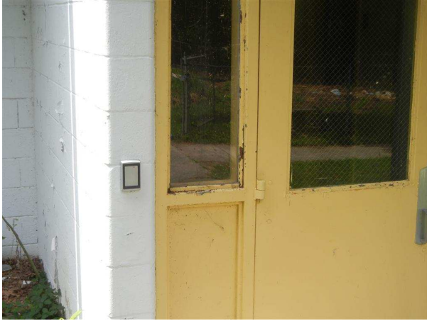
Card readers appear to have been installed recently.