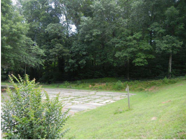
There is a significant grade change from the rear of the building to the recreational area at the north end of the site.