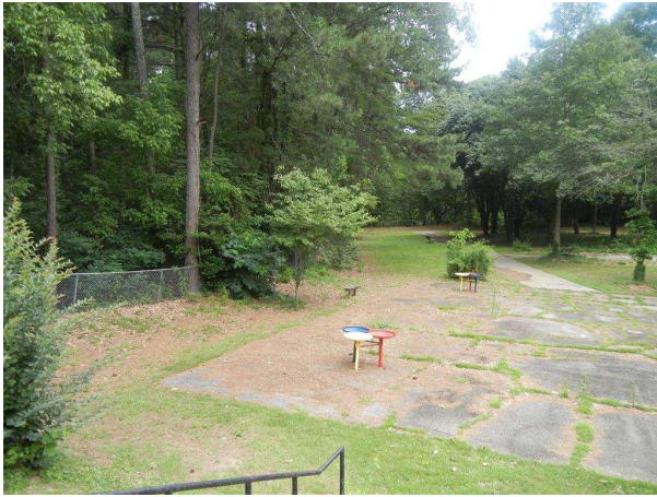
View of the recreational area.