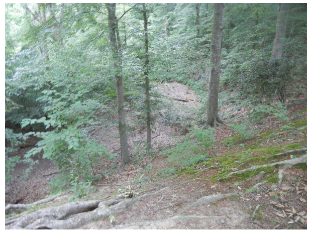
There are several trails around the perimeter of the site.