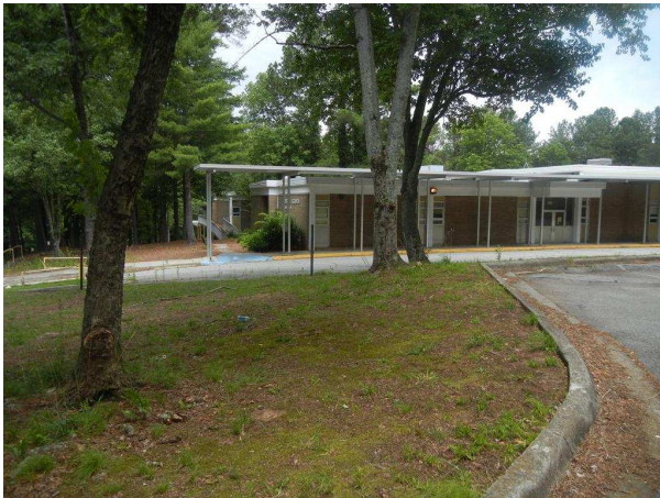
Front of Heritage Center – This is the eastern entrance of the building with what appear