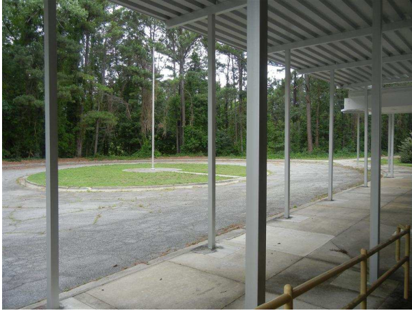
The walkways are covered.