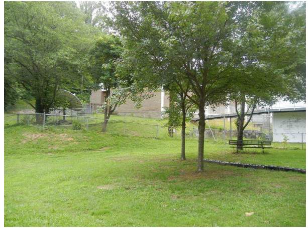
View back to the building from the rear of the site.