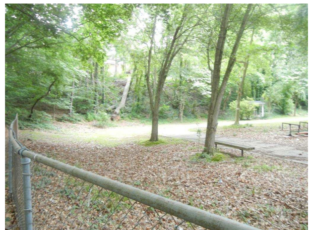
Recreational area at north end of the site. This is looking into the site from the northern edge. See following pictures.