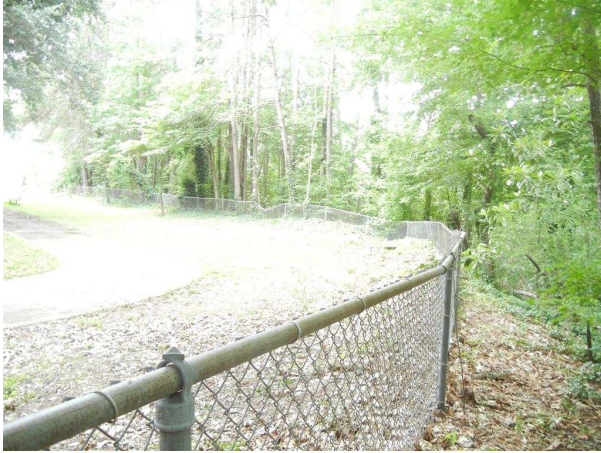
Northern perimeter of site.