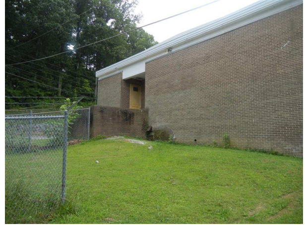
Northern end of western wing.