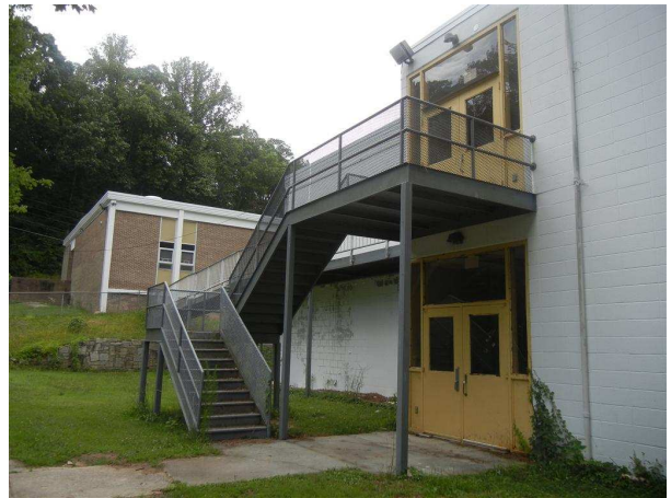
Northern end of the building.