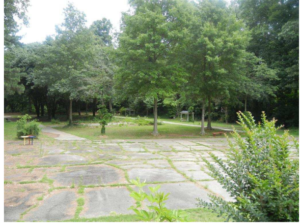
This recreational area is similar to a large garden or park.