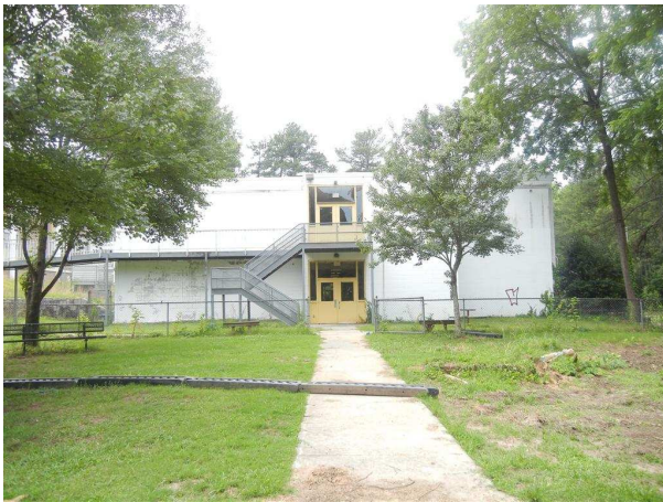
Rear of the building