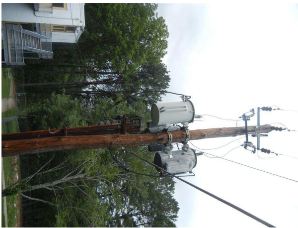
Utilities on site at rear of building