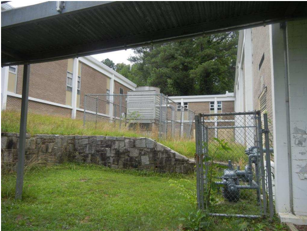
Air handling unit is sited between the major wings of the facility. Note gas meter to right.