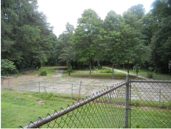
Overall view of the northern recreational area. This is qualitatively a very nice outdoor space.