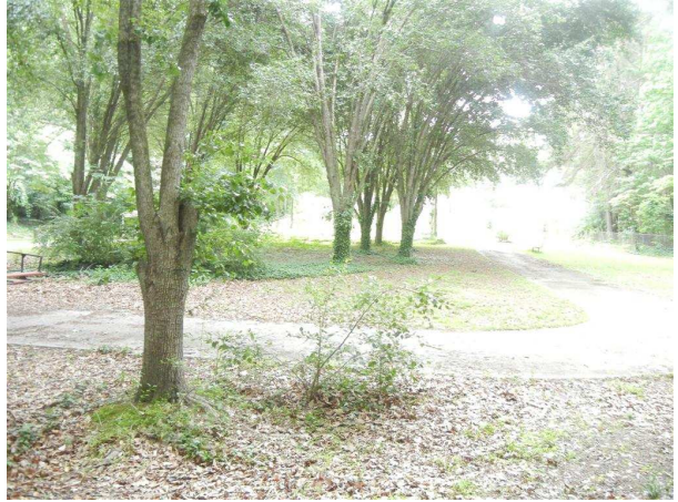
Northern perimeter and recreational area.