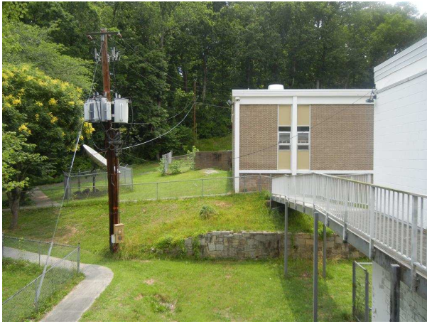
Significant utilities are located in the rear of the building and would need to be considered in any addition or site work.