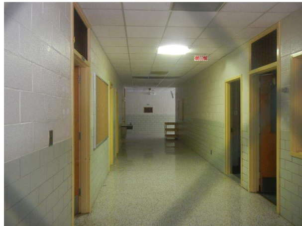
The hallways appear to be in good condition. The lights are on.