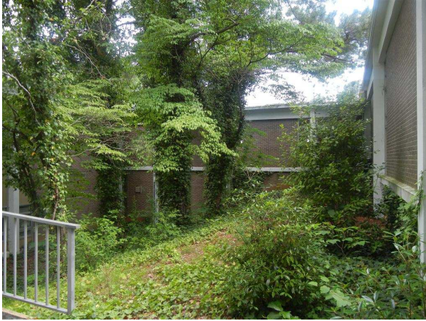
Vegetation will need to be removed from around the building.