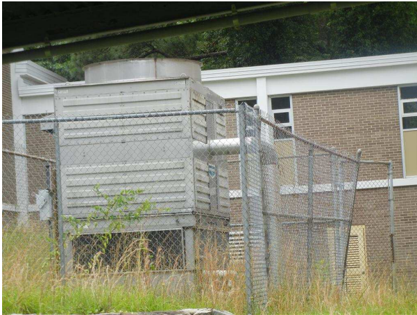
Air handling unit was operational on day of visit.