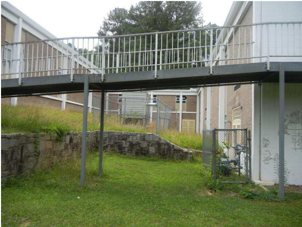
The facility has a series of ramps from one end of the building to the other. The plan is an H form.