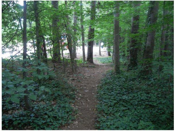
There are several trails that connect the site to McDaniel School Park.