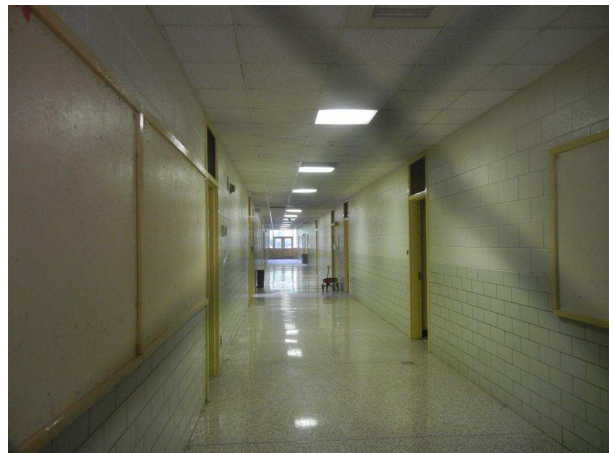
Hallways appear to be in good condition.